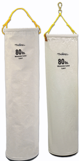
Estex #1940 & #1950

Estex's Line Hose bags, designed to provide a SAFE and easy method of hoisting Insulated Line Hose and Insulated Blankets up to the work area, are now rated to give you extra peace of mind. As always, when it comes to SAFETY , you can be certain Estex always puts you first.