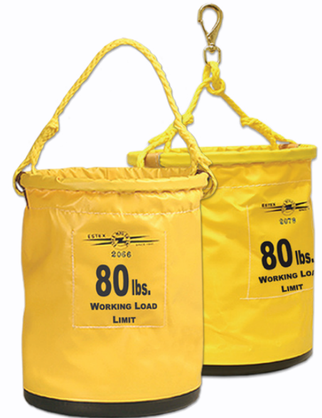
Estex #2066 & 2078