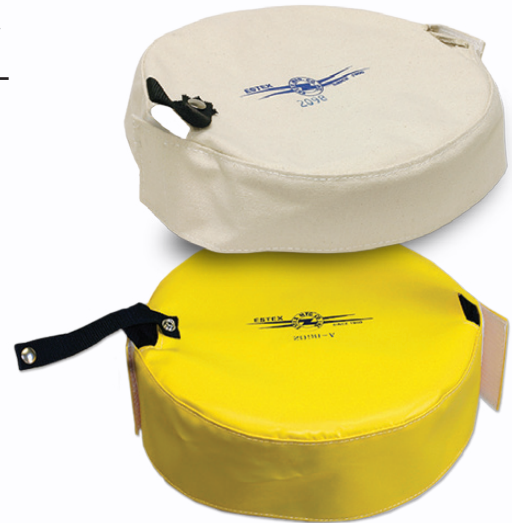
2098 & 2098-V