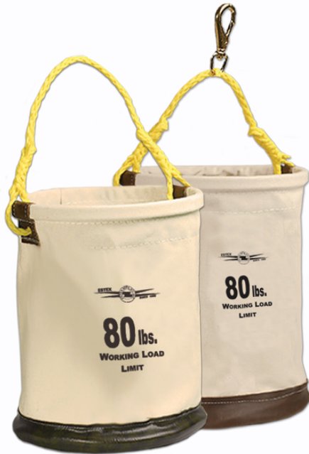
Estex #2061-17 & 2069-17

In your everyday work environment, rated rope, wire, and webbing slings are used for hoisting and positioning hardware and equipment. The rating system in these products provides the source and the rationale for the development of the Estex rated tool bucket. Standardized testing, in this case, provides a Working Load Limit that is measurable and is therefore certifiable. The goal: SAFER WORK PRACTICES LEADING TO FEWER AND REDUCED WORKER INJURIES AND CLOSING THE LOOP ON YOUR LIFTING SYSTEM.