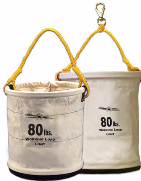
Estex #2063 & 2070