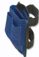
Estex #1132-HR-2P 3.5" L x 1.75" W x 6.5" H Retractor-Style Harness-Mounted 2 Pocket Tool Holster

Slit in cover allows easy access but keeps contents in