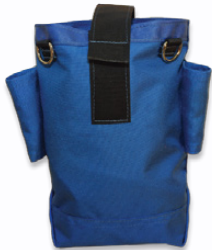
Estex #1140-DP 7" L x 4" W x 12" H Tool Control Pouch