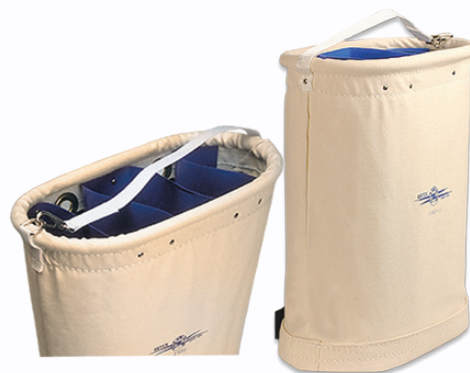
Estex # 1807-3