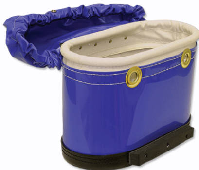
Estex # 1820-HBCS1