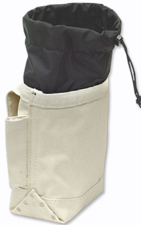
7" L x 4" W x 12" H