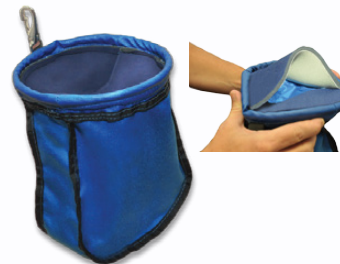
Estex #1061-CV 8.5" L x 3" W x 10" H Nut/Bolt Bag with No-Spill Cover

Slit in cover allows easy access but keeps contents in