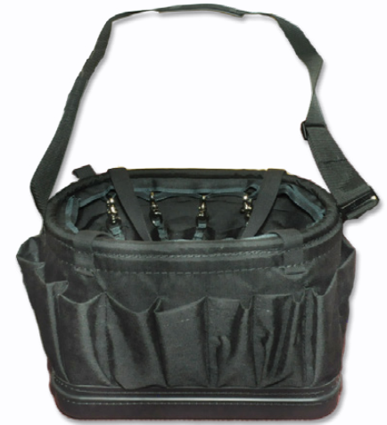
15" L x 7" W x 9" H