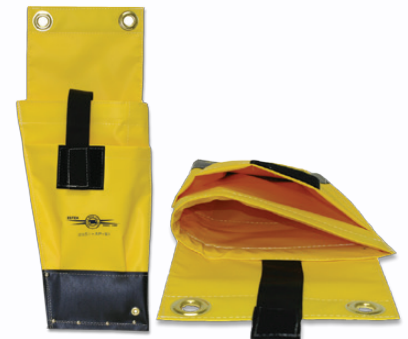
Estex # 2651-AP-S1