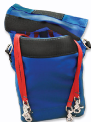
Estex #1140-DP-4TR 8.5" L x 3" W x 12" H Tool Control Pouch With Lanyards