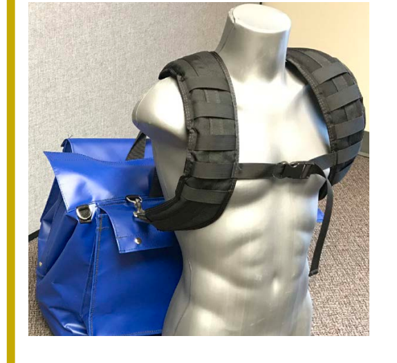
Part Numbers: 2117-WM2SAP-BL 2117-WM20SP-BLU 2117-WM2-HDL 2117-WMVSA2P-BL 3057