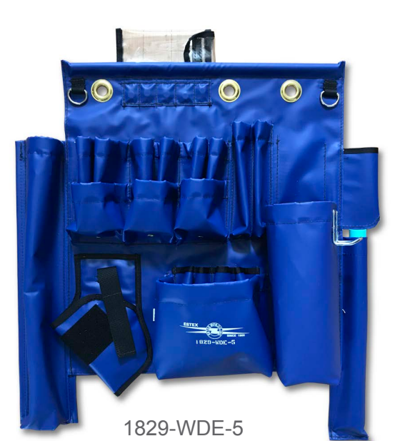
*Magnetic socket pocket