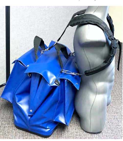
Dimensions: 24"L x 20"Top/10"W Bottom x 19"H